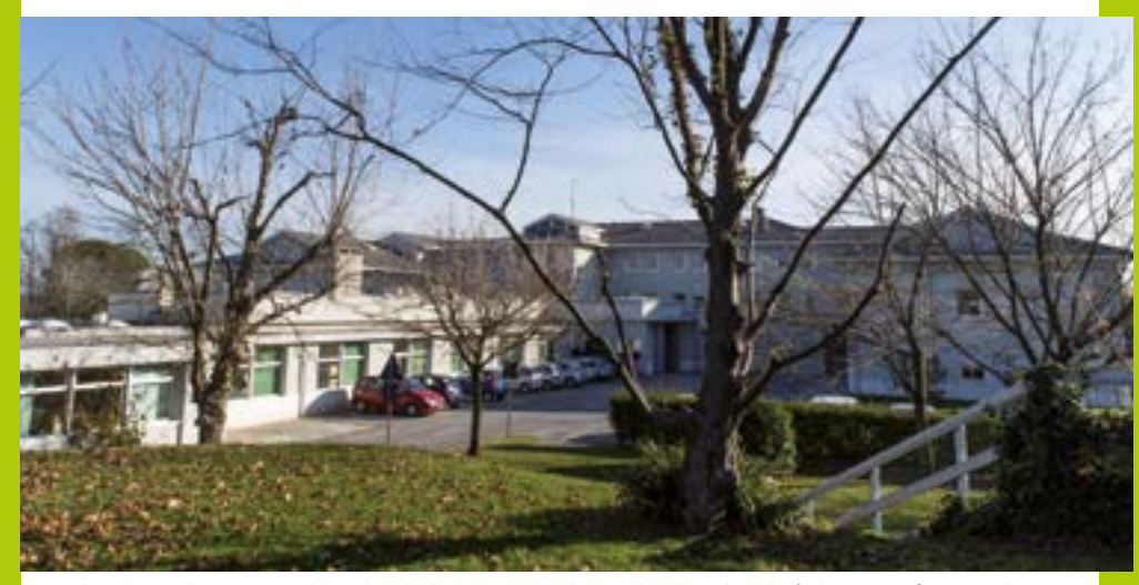
For the photo shoot we wish to thank the Photographic and Cultural Club L'Obiettivo of Pasian di Prato